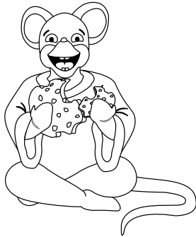
Pete the Sweet Mouse