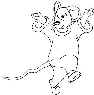
Kent the Manipulative Mouse