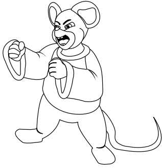
Robby the Naughty Mouse

Can you help Robby the Naughty Mouse find his shadow?