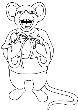
Freddy the Fruity Mouse