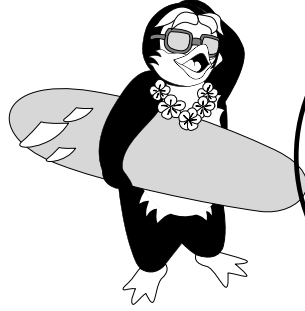
Porter the Longboarder