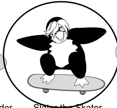
Slater the Skater