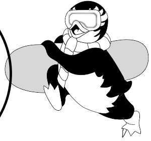
Joe the Snowboarder