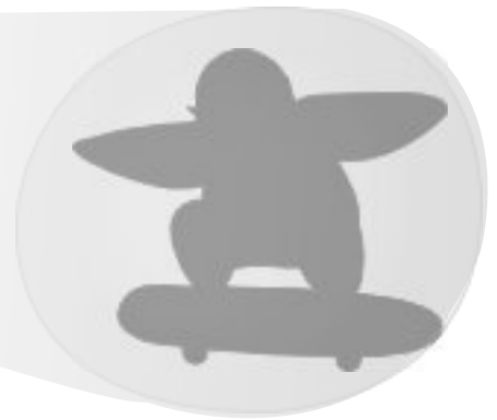
Slater the Skater

Can you help Sam the Policeman find the Suspect that matches this shadow?