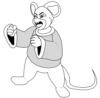
Robby the Naughty Mouse