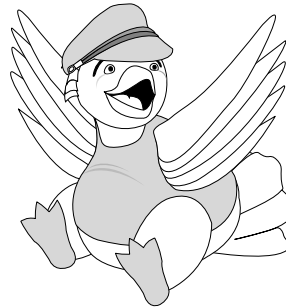
Skylit the Pilot